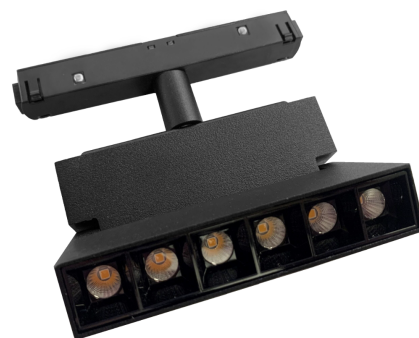
Magnetic LED light to be installed on 48 V magnetic track