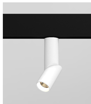
Magnetic LED light to be installed on 48 V magnetic track