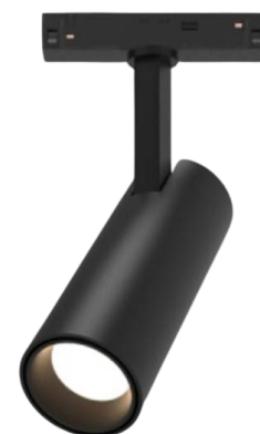
Magnetic LED light to be installed on 48 V magnetic track