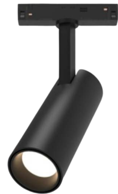
Magnetic LED light to be installed on 48 V magnetic track