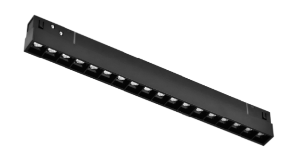
Magnetic LED light to be installed on 48 V magnetic track