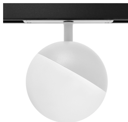
Magnetic LED light to be installed on 48 V magnetic track