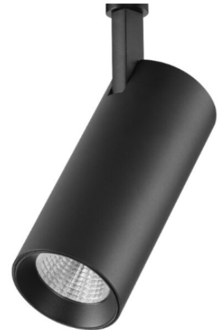
Magnetic LED light to be installed on 48 V magnetic track