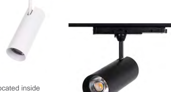
LED light to be installed on 3-phase 4 wire track.